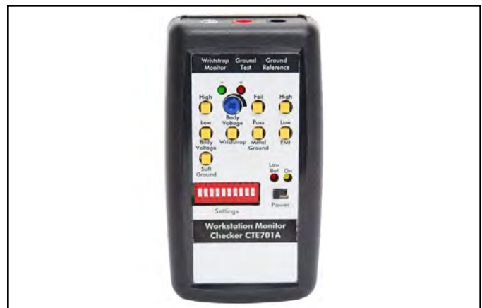
Figure 3. SCS CTE701 Workstation Monitor Checker

The checker verifies the proper operation of dual wrist strap monitoring. Connect a 3.5 mm test cable to both the checker and to the operator jack of the monitor. At this point the monitor should indicate failure. Depress the Pass button on the wrist strap section. The monitor should indicate a good connection. While pressing the Pass button, press body voltage “high.” At this point the Wrist Strap LED would be blinking red.