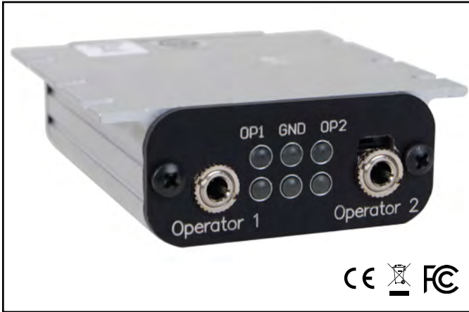
Figure 1. SCS CTC337 Wrist Strap and Ground Monitor