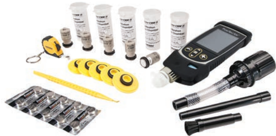
PosiTector CMM IS Pro Kit includes the PosiTector DPM Advanced

Replacement chambers, salt solutions, tools, caps, stackable probe extensions, and fins are available upon request