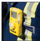
Easy To Wear