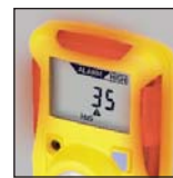
Easy to See