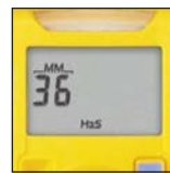
Easy to Read