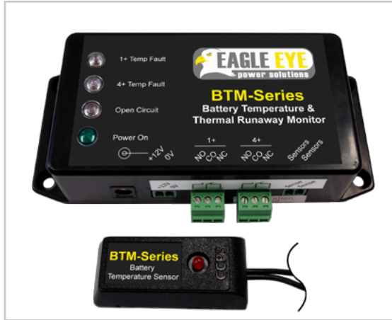
BTM-Series Monitor & Sensor