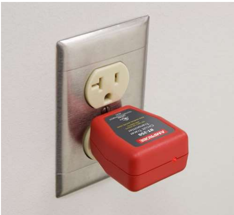
Plug the transmitter into an outlet and receiver will find the corresponding breaker.