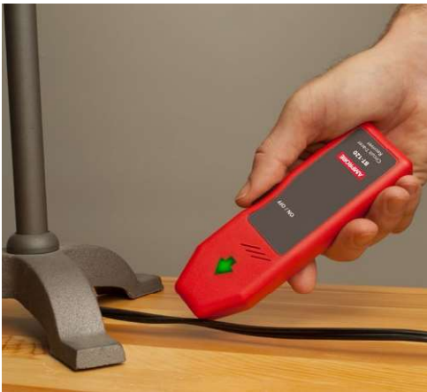
Designed for use in residential and light commercial environments.