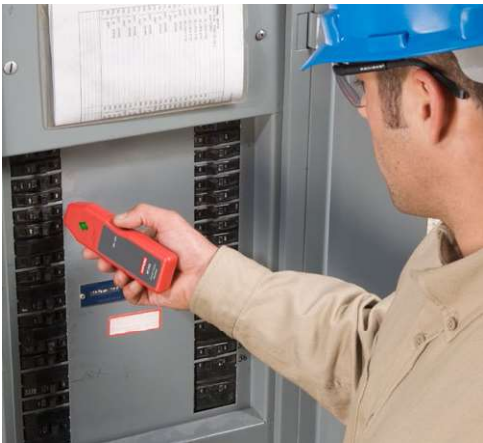
The receiver always finds the right breaker - automatic sensitivity adjustment removes ambiguity from the search by indicating single, correct breaker with light and sound.