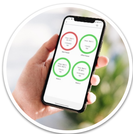
Neat Mobile View