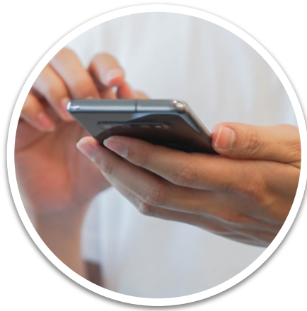
Text Message Alarm