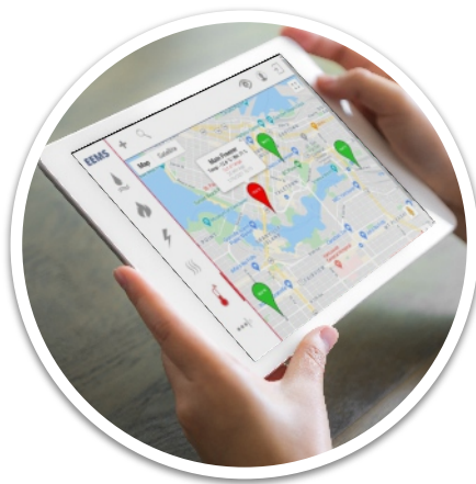
Geographical Based Display