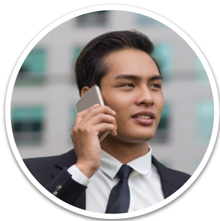
Phone Call Alarm