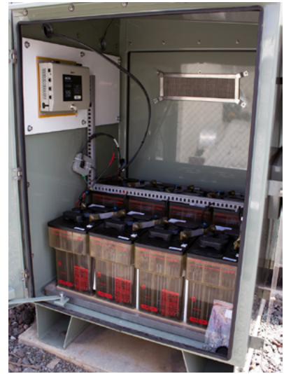
Installation to 48V Switchyard Battery

Reduce maintenance costs, improve up-time and manage your battery assets effectively by using the BDS-Pro battery monitoring solution for your system. Protect yourself from battery failure - one of the leading causes of facility downtime with battery monitoring.