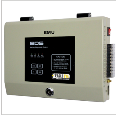
Main Processing Unit (MPU)

Common Applications: Power Utilities & Distribution, UPS Systems, Telecom