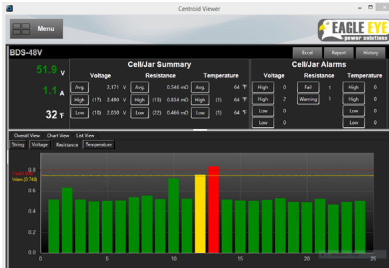
Centroid 2 Battery Management Software