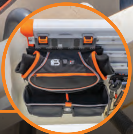
Connects to the Bucket Work Center Rail System