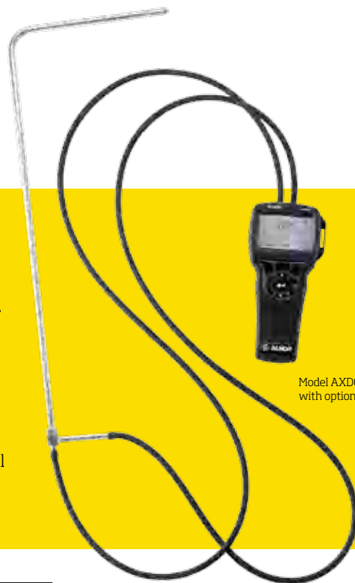
Model AXD620 shown with optional pitot probe

The AXD620 is a rugged, compact, comprehensive Micromanometer that measures pressure, and calculates velocity and volumetric flow rate. It can be used with Pitot tubes to measure velocity and then calculate flow rates with user-input duct size and shape. Premium features make it ideal for HVAC, environmental safeguards, commissioning, process control and system balancing.