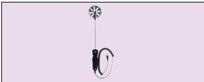
Model VP1, Wired 100 mm Vane Thermo-Anemometer Probe