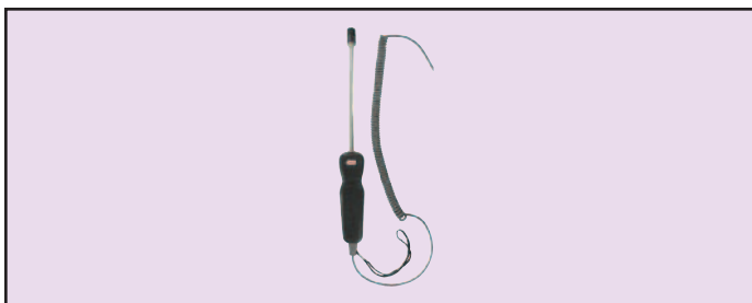
Model RP1, Wired Thermo-Hygrometer Probe