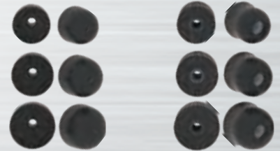
Silicone Tips x3 sets