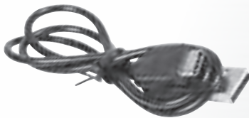
USB-A to USB-C Charging Cable