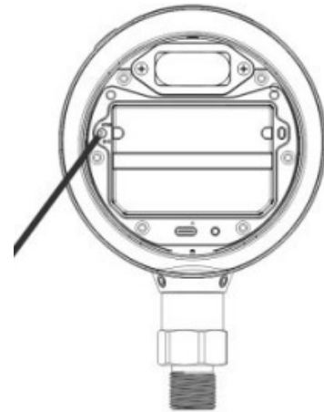
Diagram 5.2 (6 – BP inlet port)