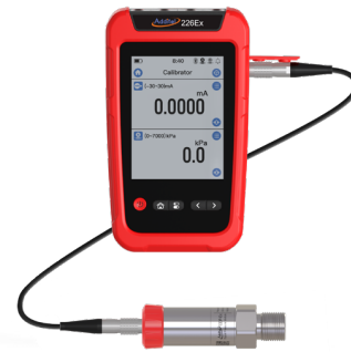
Additel 226Ex with ADT161Ex Pressure Module