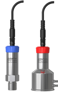
Gauge pressure Differential pressure