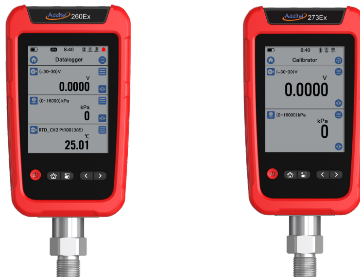
Additel 273Ex and 260Ex with ADT158 pressure module installed