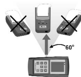
Horizontal Print Angle