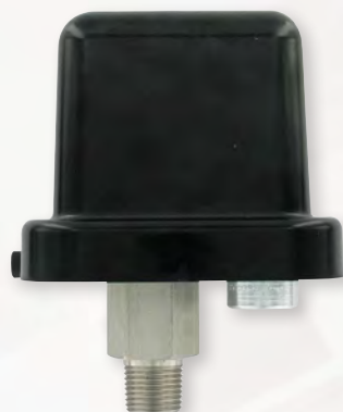
A1F with -PC weatherproof housing