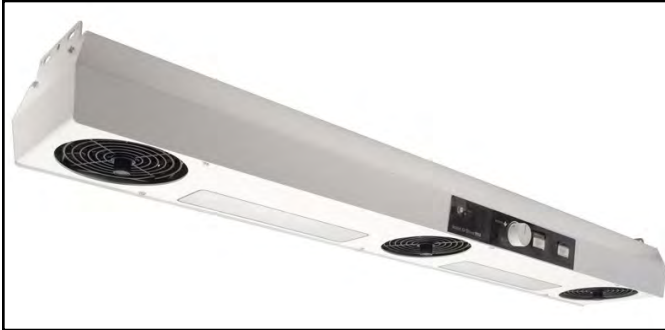
Figure 1. SCS 991A Overhead Air Ionizer