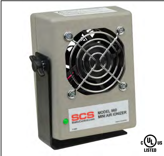
Figure 1. SCS 960 Mini Air Ionizer