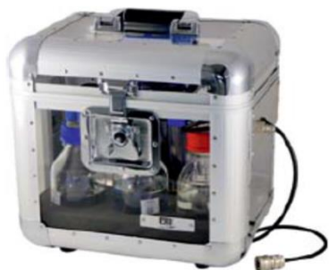
Portable SYNGAS washing device