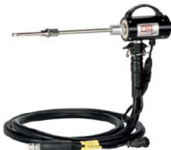
Gas sampling probe with heated filter and heated sampling line for use at raw (dirty) SYNGAS with heavy hydrocarbons or tar