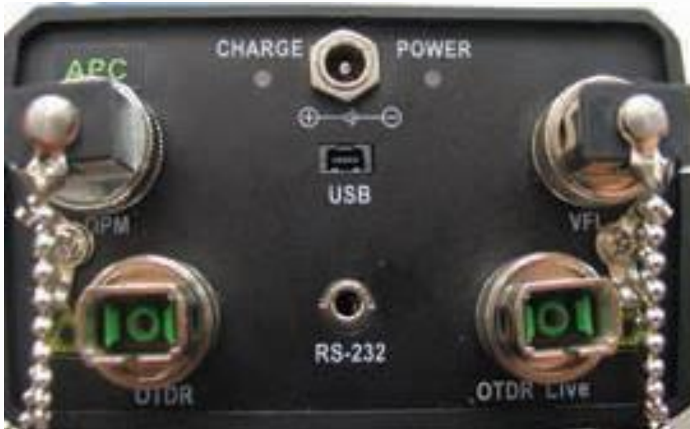
1310 and 1550nm Port

The 930XC-30F OTDR uses a 1625nm probe pulse to measure live or potentially live fiber optic networks. This is necessary so that network traffic is not disrupted during testing and troubleshooting processes.