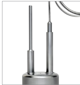
Rigid Transitional Diameter Probe (TD)

All HiTemp140X2 Series data loggers feature two temperature channels. The channel number for each probe is identified on the top of the logger as shown to the right. The MadgeTech 4 Software will list the temperature channels in sequence, listing channel 1 first and channel 2 second, under the data logger device ID as shown below.