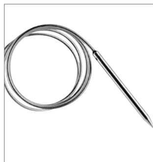
Stainless Steel Bendable RTD Probe (PT)