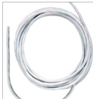
Flexible RTD Probe (FP)