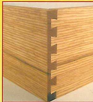
Cuts Half-Blind Joints

Includes: 1/2" Dovetail Router bit, User's Manual