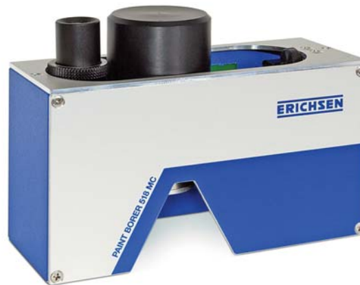
PAINT BORER 518 MC

Thickness measuerments in accordance with the standardised wedge cut method