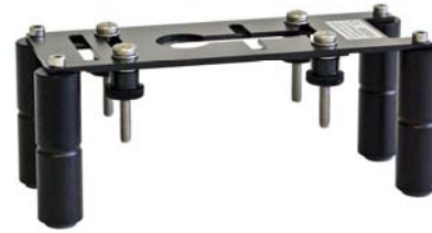
PAINT BORER 518 MC with specimen platform