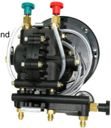
"New" Manifold Design