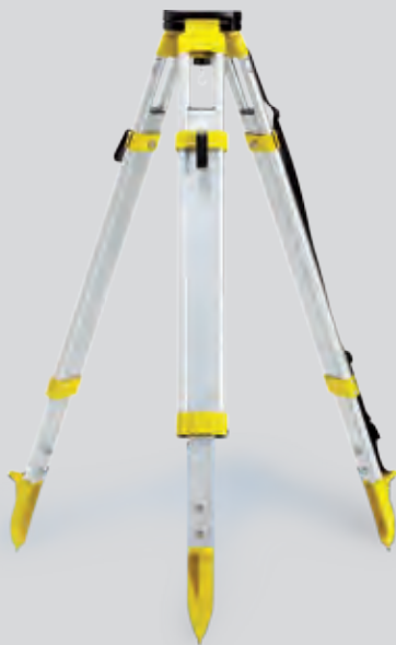
CTP104 round-base tripod Aluminium tripod with carrying straps, fast clamps, 5/8" screw. Telescopic from 85–160 cm Item no. 767 710

Optimise the performance of your Leica NA700 level with the specially tailored accessories.