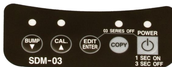
Control Panel View