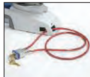
Security Device accessory (Lock & cable sold separately)