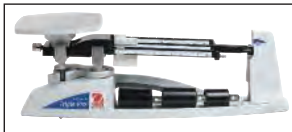
Three masses included with balance