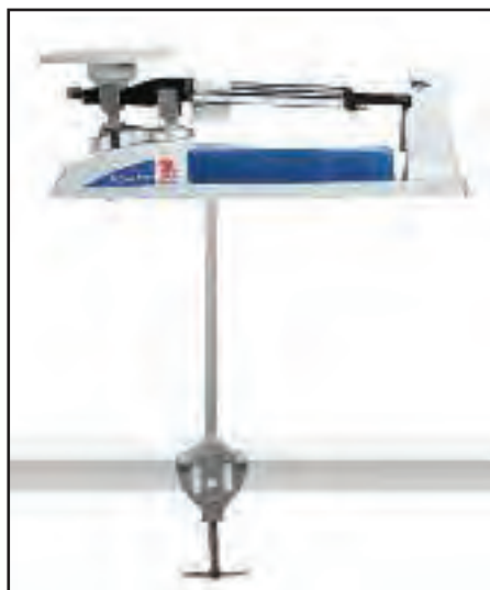
Included Rod & Clamp accessory for specific gravity experiments