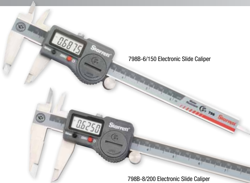
798B-6/150 Electronic Slide Caliper