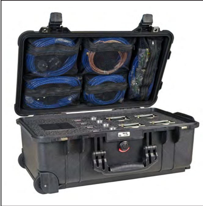
Figure 1. SCS 770051 ESD Event Diagnostic Kit