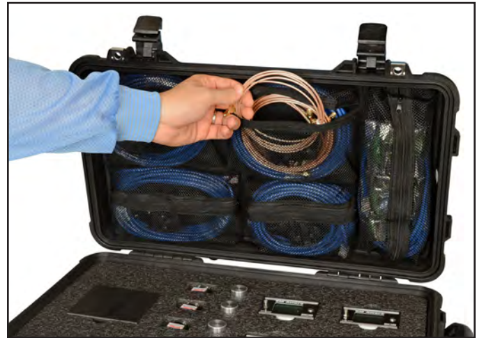
Figure 2. Using the the lid organizer to store accessories

Per ANSI/ESD S20.20 section 6.1.3.1 Compliance Verification Plan Requirement "A Compliance Verification Plan shall be established to ensure the organization's compliance with the requirements of the Plan. Formal audits or certifications shall be conducted in accordance with a Compliance Verification Plan that identifies the requirements to be verified, and the frequency at which those verifications must occur. Test equipment shall be selected to make measurements of appropriate properties of the technical requirements that are incorporated into the ESD program plan."