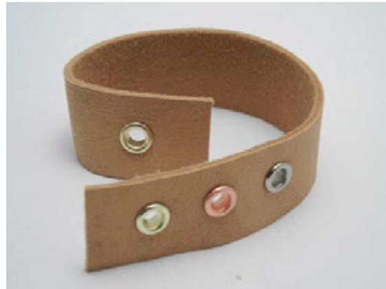
[Photo 7: "Finished" side of eyelets shows on "Smooth" side of work material.]