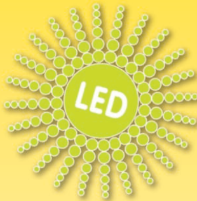
No. 70393 12" (305 mm)