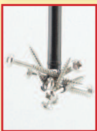
No. 70390 24" (610 mm)