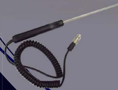
NEW: Thermal Probes

Each temperature probe utilizes a high-quality, Pt100 resistance element; with accuracy per IEC class B. Handles are made from ABS and are 100mm long and are rated to 90C. Probes have coiled 1-meter long polyurethane cables.