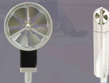
Choice of 2.75" or 1" Vane Head