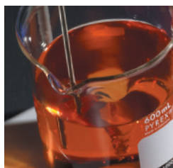
Temperature Probe for precision liquid temperature control in the liquid (as opposed to the plate top)