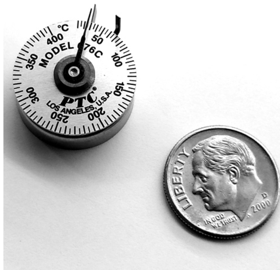
Model 676C Miniature Spot Check ® Surface Thermometer Shown Twice Actual Size