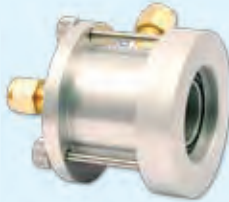
Flow through adaptors