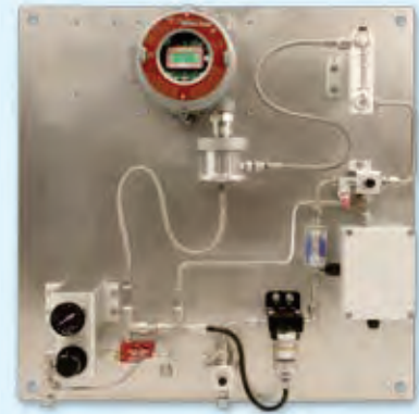
Air aspirator adaptors / panels