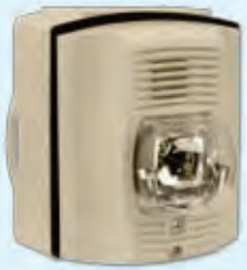
Remote horns & lights