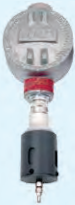
Remote Mount Calibration Adaptor