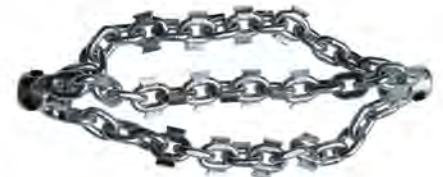
Carbide Tipped Chain Knockers