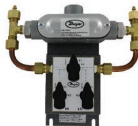
3-way valve assembly with integral bleed screws