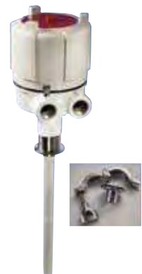
PROCAP I & II 3-A