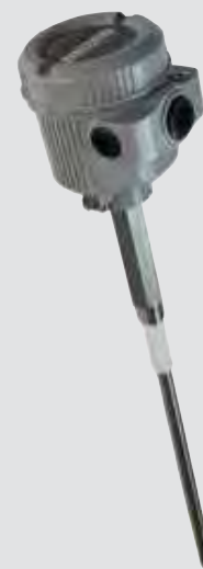
DD-3000 Dust Alert

Approvals: Ordinary/General Purpose Only, CE Approved (CSA/UL Approval Pending)