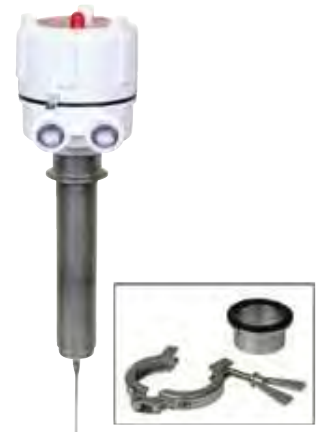
VR-31 Sanitary Vibrating Rod

Measuring Principle: Vibration Ambient/Operating Temperature: -4°F to +140°F (-20°C to +60°C) Process Temperature: To 176°F standard (80°C); to 284°F high temp (140°C) Conduit Connection/Entry: 3/4" Enclosure Material: Die cast aluminum, USDA approved powder coat finish Enclosure Rating: NEMA 4, 5 & 12 Material Density: From 1.25 lb./cu. ft. Mounting: 1-1/2" NPT Fitting: 2" sanitary 316 SS fitting with tri-clamp Output: DPDT 5 amp @ 250 VAC Power: Wide range 20-250V AC/DC Pressure: 145 psi Rod: 304 stainless steel, 11.81" insertion length Relay/Switch: DPDT 5A @ 250 VAC Time Delay: 1 second from stop of vibration, 2 to 5 seconds for start of vibration