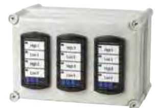
Annunciator Point Level Alarm Panel

Ambient/Operating Temperature: -40°F to +300°F (-40°C to +149°C) Enclosure Rating: NEMA 4X Power: 115 VAC ± 10%, 50/60 Hz, 3 VA. 230 VAC ± 10%, 50/60 Hz, 3 VA. 24-48 VDC, 2 W maximum Relay/Switch: SPDT, 2 Amp 240 VAC