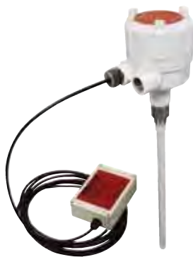
PRO REMOTE Remote Capacitance Probe