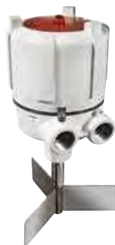
MAXIMA+ Fail-Safe Rotary

Relay/Switch: SPDT 10 Amp, 250 VAC (solid state relays optional)