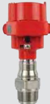
NCR-80 Non-Contact Radar

Measuring Principle: Radar Power: 90 to 253 V AC, 50/60 Hz (regular voltage version) Output: 2-wire 4-20 mA/HART, 4-wire 4-20 mA/HART, Modbus RTU Ambient Temperature: -40°F to 176°F (-40°C to 80°C) Process Temperature: -40°F to 392°F (-40° to 200°C) Mounting: 1-1/2" NPT process connection, DN 80 flange, DN 100 flange with swivel holder, mounting strap, DN 100 adapter flange, DN 80 compression flange depending on model Approvals: CSA / FM Class I, II, III, Div 1, Groups A, B, C, D, E, F, G Pressure: -14.5 to +43 PSI, -1 to +3 bar (-100 to +300 kPa) Range: 393 feet (120 m) Update Rate: < 1 second Resolution: 0.3uA analog, < 1mm (0.039) Accuracy: ± 0.2" (5mm) Enclosure Material: Aluminum, plastic, or stainless steel Enclosure Rating: IP66/IP68 (0.2 bar), IP66/IP67, IP66/IP68 (1 bar) Frequency: 79 GHz Beam Angle: 4°