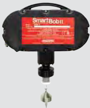
SmartBob II Cable-Based Sensor

Measuring Principle: Cable Power: 115/230 VAC 50/60 Hz Output: RS-485/Modbus/Analog Ambient Temperature: -40°F to +185°F (-40°C to +85°C) Process Temperature: Up to 500°F (260°C) Mounting: 3" NPT Approvals: Class II, Groups E, F, & G Range: Up to 150 ft. (45 m) Rate: 2 feet per second Resolution: 0.15" (0.4 cm) Accuracy: ± 0.25% of distance measured Enclosure Material: Molded polycarbonate Enclosure Rating: NEMA 4X, 5, 9 & 12 (IP65)