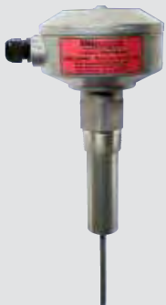
CVR-600 Compact Vibrating Rod

Measuring Principle: Vibration Ambient/Operating Temperature: -4°F to +150°F (-40°C to +65°C) Process Temperature: To 176°F standard (80°C); to 300°F high temp (150°C) Conduit Connection/Entry: 1/2" Enclosure Material: Die cast aluminum, powder coated Enclosure Rating: NEMA 4 Material Density: From 2 lb./cu. ft. Mounting: 1" NPT Power: Wide range 20-250V AC/DC Power Consumption: 3 VA Pressure: 145 psi Rod: AISI 302 stainless steel, 6" insertion length Relay/Switch: SPDT 5A 250 VAC Time Delay: 1 second from stop of vibration, 2 to 5 seconds for start of vibration Wiring Cable: 1/2"