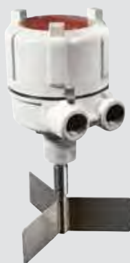
BMRX Standard Rotary