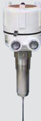
VR-21 Standard Vibrating Rod

Measuring Principle: Vibration Ambient/Operating Temperature: -4°F to +140°F (-20°C to +60°C) Process Temperature: To 176°F standard (80°C); to 284°F high temp (140°C) Conduit Connection/Entry: 3/4" Enclosure Material: Die cast aluminum, USDA approved powder coat finish Enclosure Rating: NEMA 4, 5 & 12 Approvals: CSA/US Class II, Groups E, F, & G (optional) Material Density: From 1.25 lb./cu. ft. Mounting: 1-1/2" NPT Output: DPDT 5 amp @ 250 VAC Power: Wide range 20-250V AC/DC Pressure: 145 psi Rod: 304 stainless steel, 7.37" insertion length Relay/Switch: DPDT 5A @ 250 VAC Time Delay: 1 second from stop of vibration, 2 to 5 seconds for start of vibration