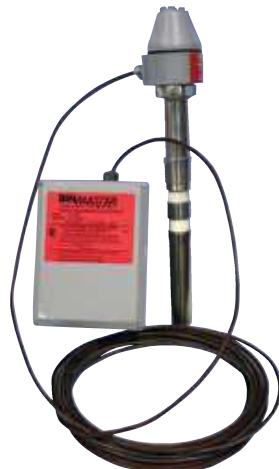
PRO HTRC-20 Remote Capacitance Probe

Measuring Principle: Capacitance Ambient Temperature: -40°F to +185°F (-40°C to +85°C) Probe: 9" stainless steel and ceramic Enclosure Material: Die cast aluminum, powder coat finish Enclosure Rating: NEMA 4X, 5, & 12 Output: DPDT 5 amp @ 250 VAC Power: 115 or 230 VAC 50/60 Hz ±15% Power Consumption: 3 VA Pressure: 100 PSI Process Temperature: Up to 1112°F (600°C)