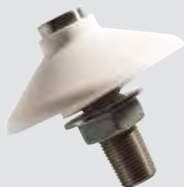
Airbrator Aeration & Vibration

Approvals: FDA 21CFR177.2600 (a – e, g, h)