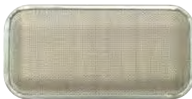
Air Pads Flow Enhancer