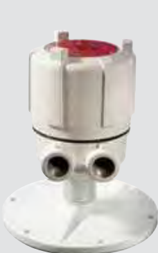
PROCAP I & II FL Flush Mount Capacitance Probe