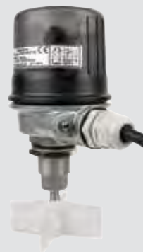
Mini Rotary Compact Rotary