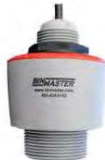
CNCR-120 Compact Non-Contact Radar

Measuring Principle: Radar Power: 12 to 35 VDC, 8-30VDC Output: 2-wire 4-20 mA, 4-wire Modbus Ambient Temperature: -40°F to +140°F (-40°C to +60°C) Process Temperature: -40°F to +140°F (-40°C to +60°C) Mounting: 1.0" Threaded NPT, 1.0" Threaded Straight Approvals: Unclassified area, non-EX environment, general purpose FM/CSA/CE; FM/CSA/ATEX/IEEx Class I, II, III; ATEX/IEEx Zone 1, ½ Pressure: -14.5 to +43.51 psi (-1 to +3 bar/-100 to +300 kPa) Range: Up to 98 ft. (30 M) depending on model Update Rate: <1 second Accuracy: ≤ 0.2" (5 mm) Enclosure Material: PVDF Enclosure Rating: IP66/IP68 (3 bar) Frequency: 80 GHz Beam Angle: 8° (4° for 190)