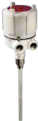
PROCAP I & II