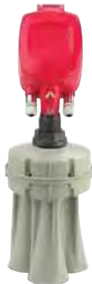
3DLevelScanner Non-Contact Sensor

Measuring Principle: Acoustic Power: 20 - 32 VDC Output: 4-wire 4-20mA/HART/RS-485/Modbus Ambient Temperature: -40°F to 185°F (-40°C to 85°C) Process Temperature: -40°F to 185°F (-40°C to 85°C) Mounting: 0°, 5°, 10°, 20°, and 30° mounting plates and assemblies Approvals: ATEX II 1/2D, 2D, Ex ibD/iaD 20/21 T110°C, ATEX II 2G Ex ia/ib IIB T4, FM Intrinsically Safe Class I, II, Division I, Groups C, D, E, F, G Pressure: -0.2 - 1bar (-2.9 to 14.5 psi) Range: 200 ft. (61 m) Enclosure Material: Die cast aluminum, powder coated Enclosure Rating: IP67 Frequency: 3 KHz to 10 KHz