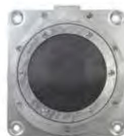
BM45 Diaphragm Switch

Power: 15 Amps @125, 250 or 480 VAC, 1/8 HP @ 125 VAC, 1/4 HP @ 250 VAC, 1/2 Amp @ 125 VDC, 1/4 Amp @ 250 VDC