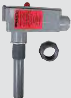
Compact PRO Mini Capacitance Probe

Measuring Principle: Capacitance Power: 115/230 VAC or 24 VDC Output Relay: SPDT 5 amp at 250 VAC Ambient Temperature: -40°F to +185°F (-40°C to +85°C) Process Temperature: To 240°F (116°C) Pressure: 150 PSI Enclosure Material: PVC Enclosure Rating: NEMA 4X, 5 & 12 Probe: CPVC Mounting: 1" NPS (1-1/4" adapter available) LED: Indicates material presence or absence