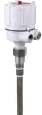
PROCAP I & II HD Heavy Duty Capacitance Probe