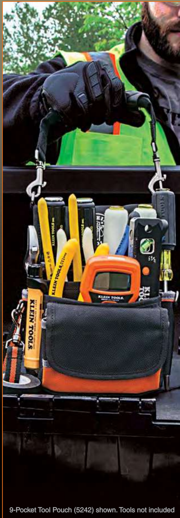
9-Pocket Tool Pouch (5242) shown. Tools not included