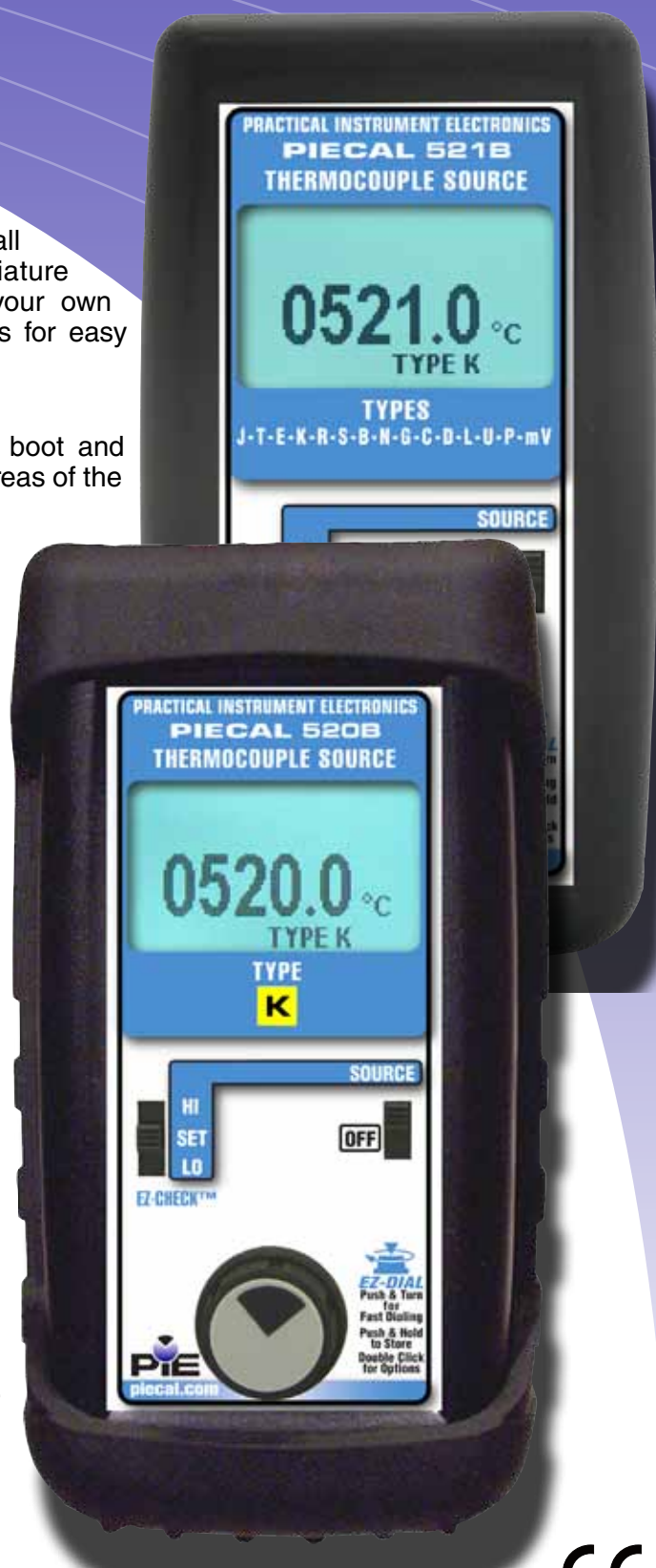
Actual Size (Shown with optional boot)

* PIECAL Calibrators are not manufactured or distributed by Fluke Corp or Altek Industries Inc, manufacturers of Altek Calibrators.