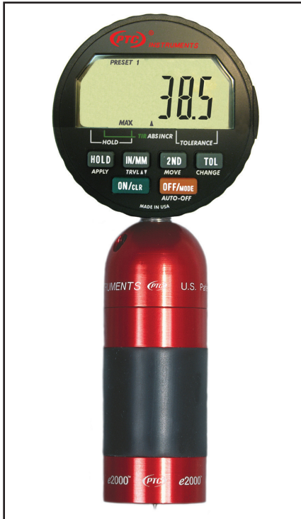
Model 512D Digital ASTM Type D Durometer for plastics, hard rubber, epoxies, etc.

The ultimate durometer for accurate hand held hardness measurements. PTC® leads you into the new millennium with this durometer's refined styling. The durometer is easy to grip and the 1.25" diameter base has a large landing area for increased stability and maximum repeatability.