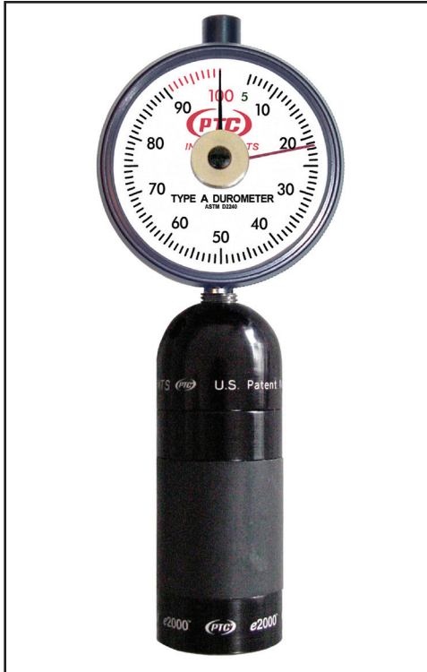
Model 501A e 2000™ Series Analog ASTM Type A Durometer