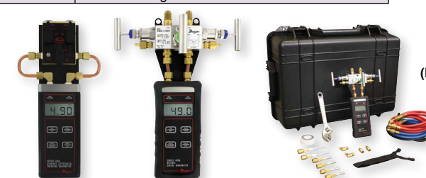
-3V Option 3-Way Vent Valve