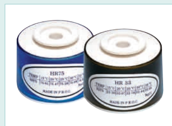
RH300-CAL Optional calibration salt bottles