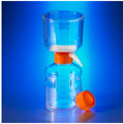
Vacuum Filtration Systems