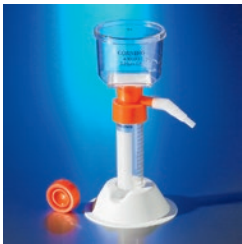
Tube Top Vacuum Systems