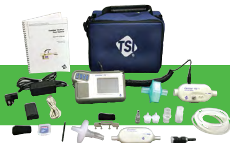
4080 High-flow test system with 4082 Low-flow kit (sold separately)