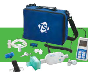
4070 High-flow test system with 4073 Oxygen sensor kit (sold separately)

TSI and the TSI Logo are registered trademarks of TSI Incorporated.