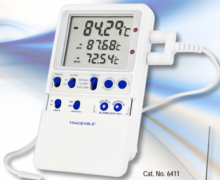
Cat. No. 6411