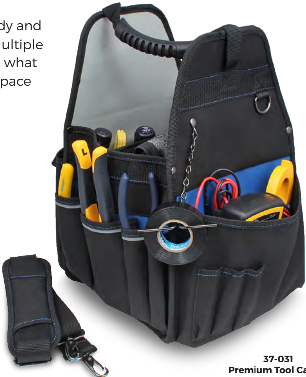
37-031 Premium Tool Carrier (Products not included)