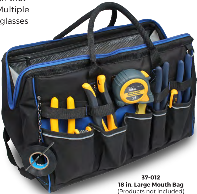
37-012 18 in. Large Mouth Bag (Products not included)