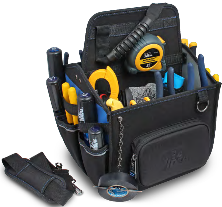
37-030 Molded Bottom Premium Tool Carrier (Products not included)