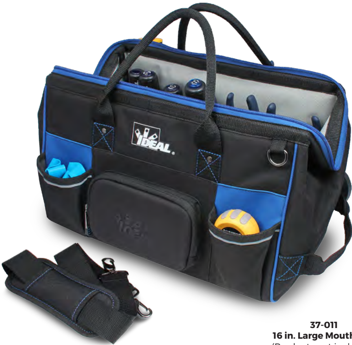
37-011 16 in. Large Mouth Bag (Products not included)