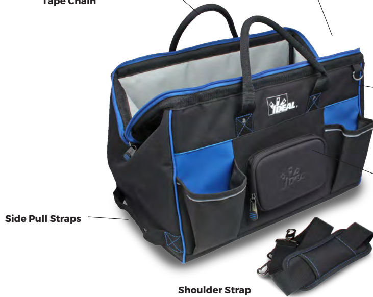
Side Pull Straps