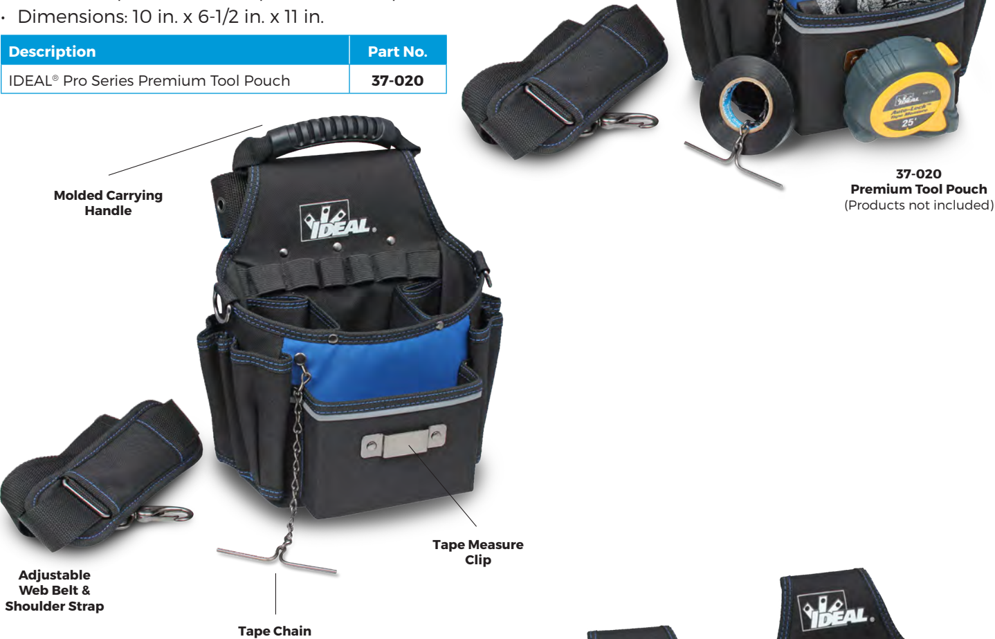
37-020 Premium Tool Pouch (Products not included)