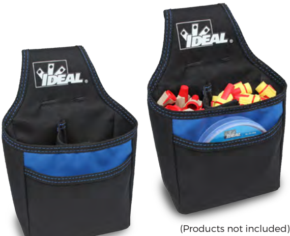
(Products not included)