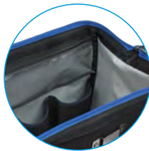
Reinforced Side Walls