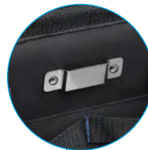
Tape Measure Clip