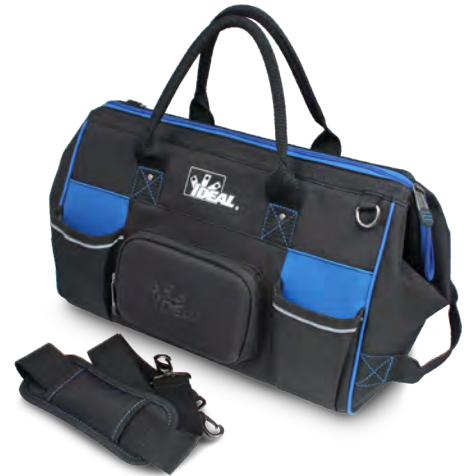
Reinforced Side Walls