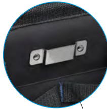
Tape Measure Clip