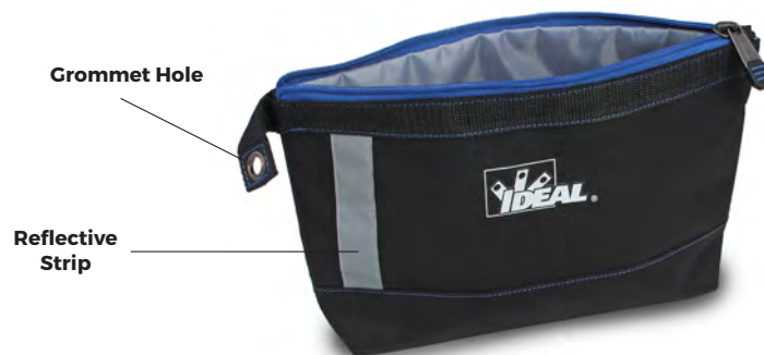
Stand Up Configuration