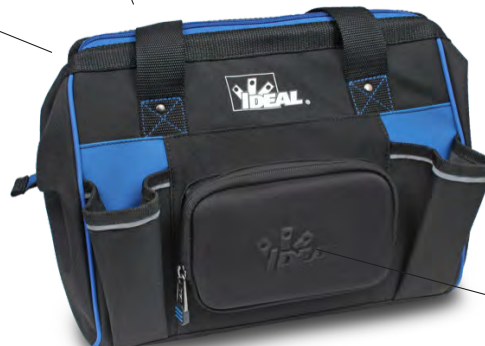
Phone / Sunglasses Case