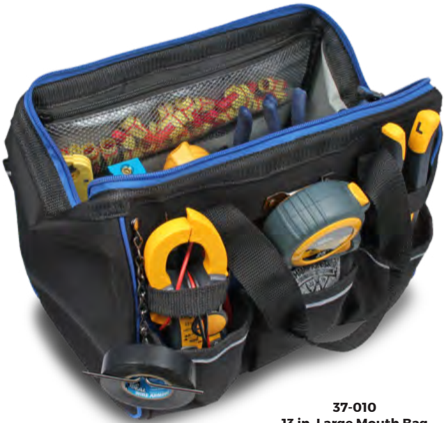
37-010 13 in. Large Mouth Bag (Products not included)