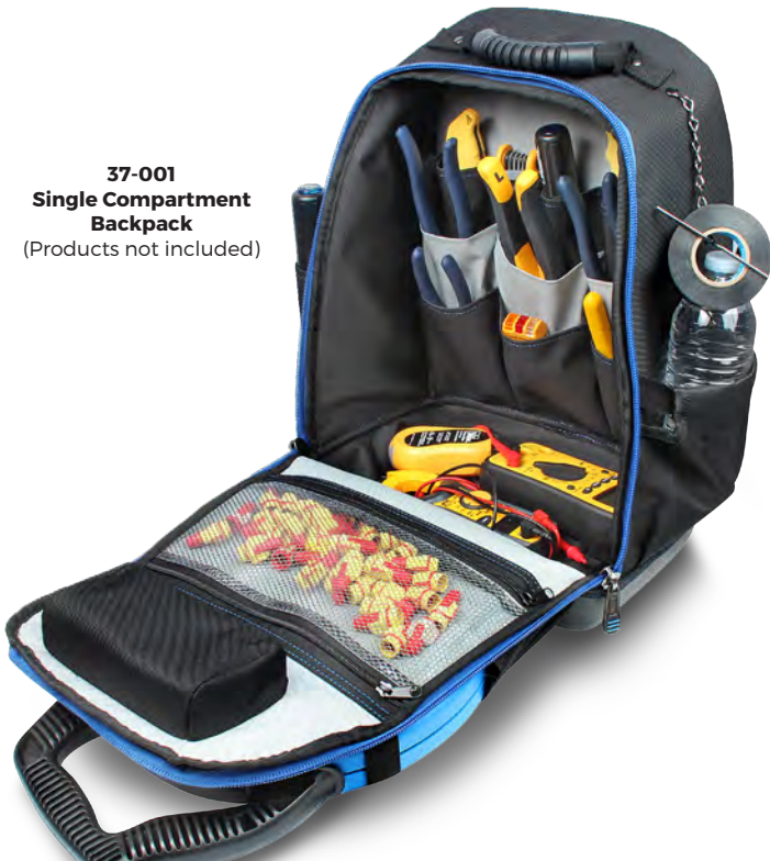
37-001 Single Compartment Backpack (Products not included)

The IDEAL® Pro Series Single Compartment Tool Backpack has a compact, lightweight design providing a solution for any tradesperson. It contains multiple tiered pockets designed to easily access and organize the tools and equipment you need most. Equipped with a protective phone/sunglasses case, durable molded bottom, a fish tape pocket, tape chain and tape measure clip, this pack has everything needed to easily manage and carry your tools between jobsites comfortably.