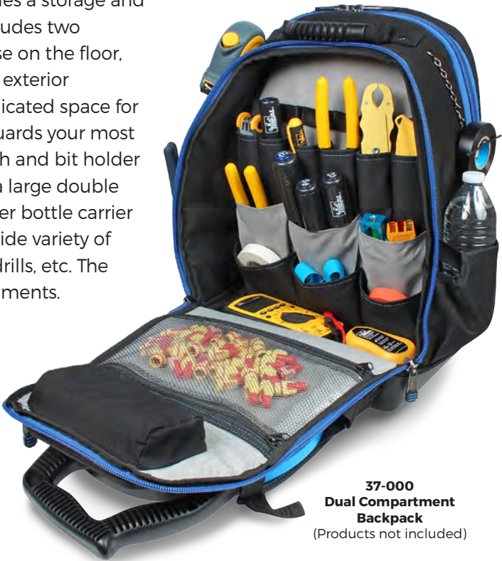
37-000 Dual Compartment Backpack (Products not included)