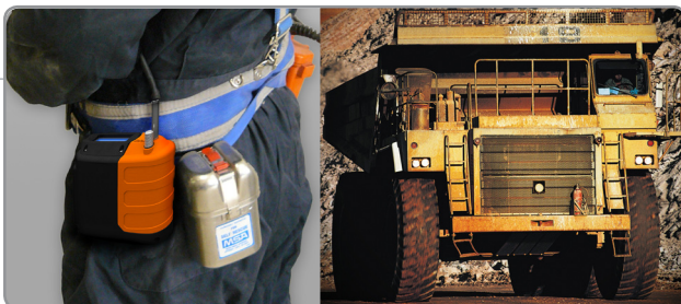
Lightweight and wearable on a belt loop or can be mounted on a vehicle or wall

Includes Airtec monitor, inlet prefilter assembly, five filter cassettes, two prefilter cartridges, USB to mini-USB PC cable, rechargeable battery with 9V/2A Universal AC adaptor (100-240VAC)