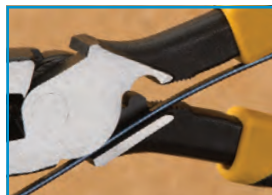
Fish tape puller