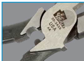
Crimp die (excludes 35-3435, 30-3455 & 35-455)